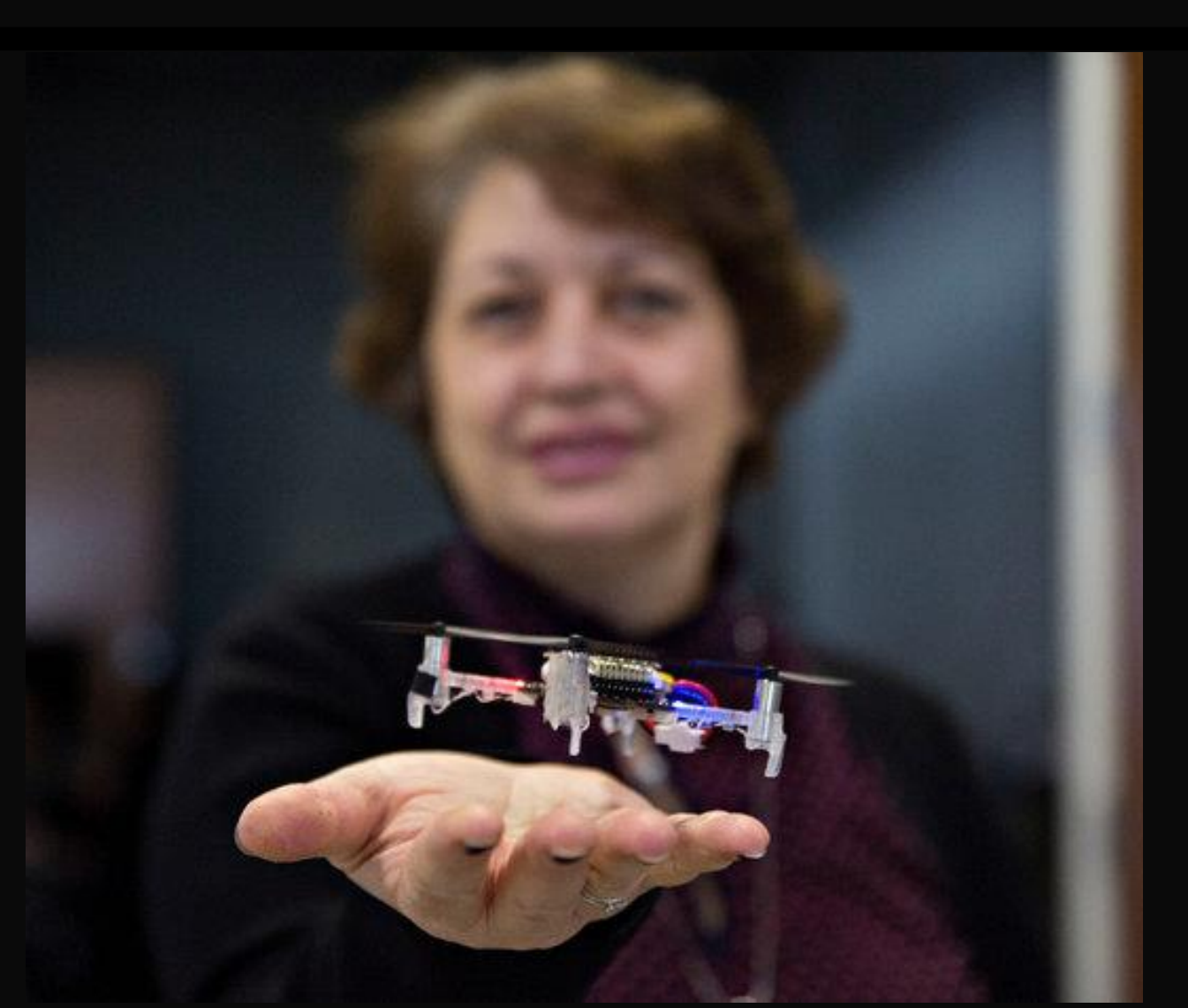
The New York Times, 2015